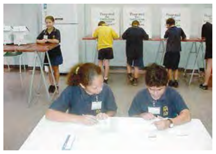
Fig 38: Voters, polling officials and a ballot box guard in a school election

Provide a small group of students with a timetable allocating voting timeframes for each class or level to vote. These students can call each group to the polling place at the appropriate time, preventing a backlog of students waiting to vote.