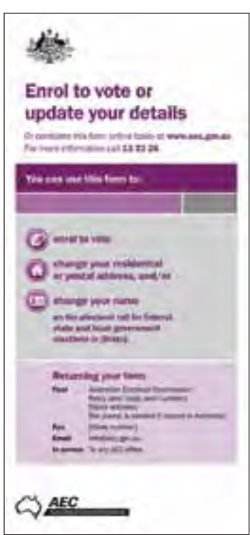
Fig 37: Enrolment form

Ballot boxes, ballot box seals, polling official badges and posters are provided free to schools by the AEC Education Section. To order your election equipment pack visit the AEC's Get Voting website to register. Allow at least two weeks for processing and postage.